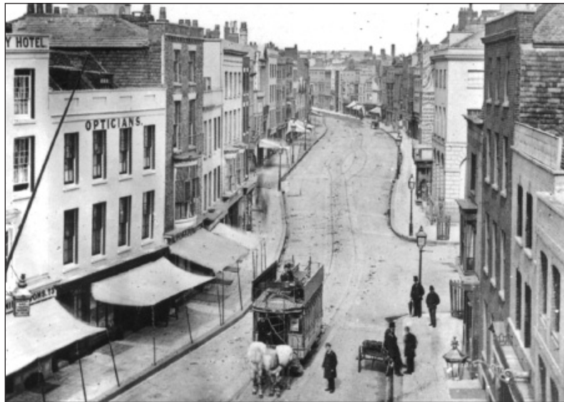
Horse trams were introduced into the old town in 1874